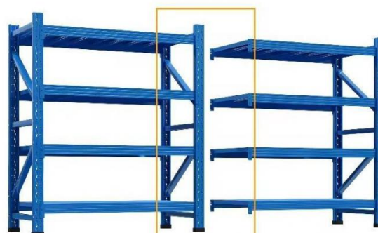
Main frame and sub frame share one column

The main frame has two columns frames, which can be used independently, Add on rack cannot be used alone, which must be used with the main rack.